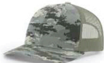
Digital Camo / Light Green