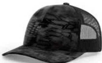
Kryptek Typhon / Black