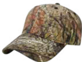
i2030 Mossy Oak® Break-Up Country®