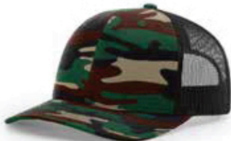
Green Camo / Black