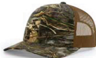
Realtree Max-7 / Buck