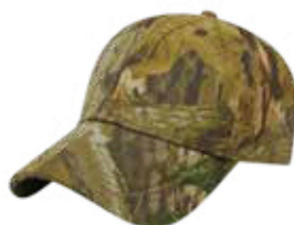
i2030 Realtree Advantage Timber®