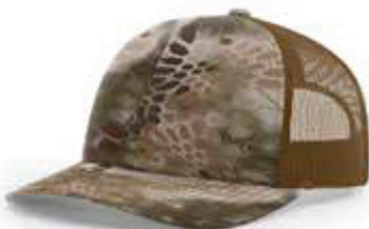
Kryptek Highlander / Buck