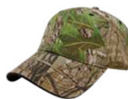
i2030 Realtree APG®