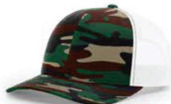
Green Camo / White