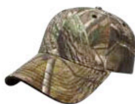
i2030 Realtree AP®