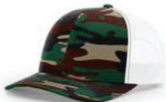
Green Camo / White