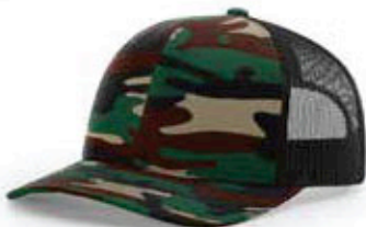
Green Camo / Black