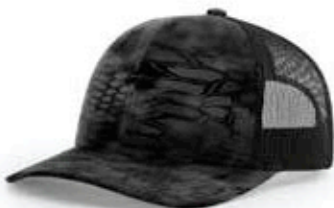
Kryptek Typhon / Black