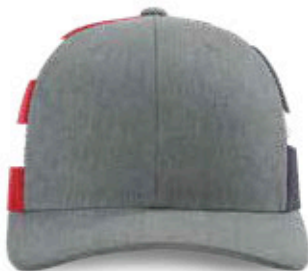
Heather Grey / Stars & Stripes