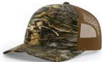
Realtree Max-7 / Buck