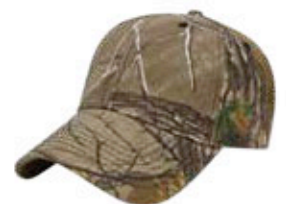
i2030 Realtree XTRA®