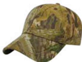
i2030 Realtree Advantage Timber®