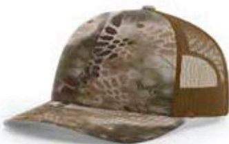
Kryptek Highlander / Buck