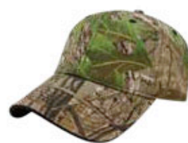
i2030 Realtree APG®