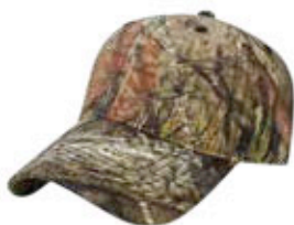
i2030 Mossy Oak® Break-Up Country®