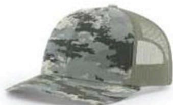
Digital Camo / Light Green